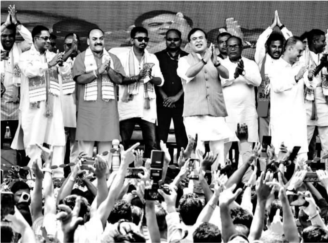
मुख्यमंत्री हिमंत विश्व शर्मा ने असम के नगांव में सोमवार को एक चुनावी सभा को संबोधित किया

57 वर्षीय शर्मा ने राज्य के चहेते 'मामा' की छवि बनाई है, जो मध्य प्रदेश के पूर्व मुख्यमंत्री और वर्तमान केंद्रीय मंत्री शिवराज