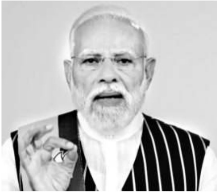
नरेंद्र मोदी, प्रधानमंत्री

पश्चिम एशिया में जारी संघर्ष का जिक्र करते हुए उन्होंने कहा कि भाजपा युद्ध के समय भी 'वसुधैव कुटुम्बकम्' की भावना में भरोसा रखती है। उन्होंने कहा कि एक समय था जब भारत हर देश से समान दूरी बनाए